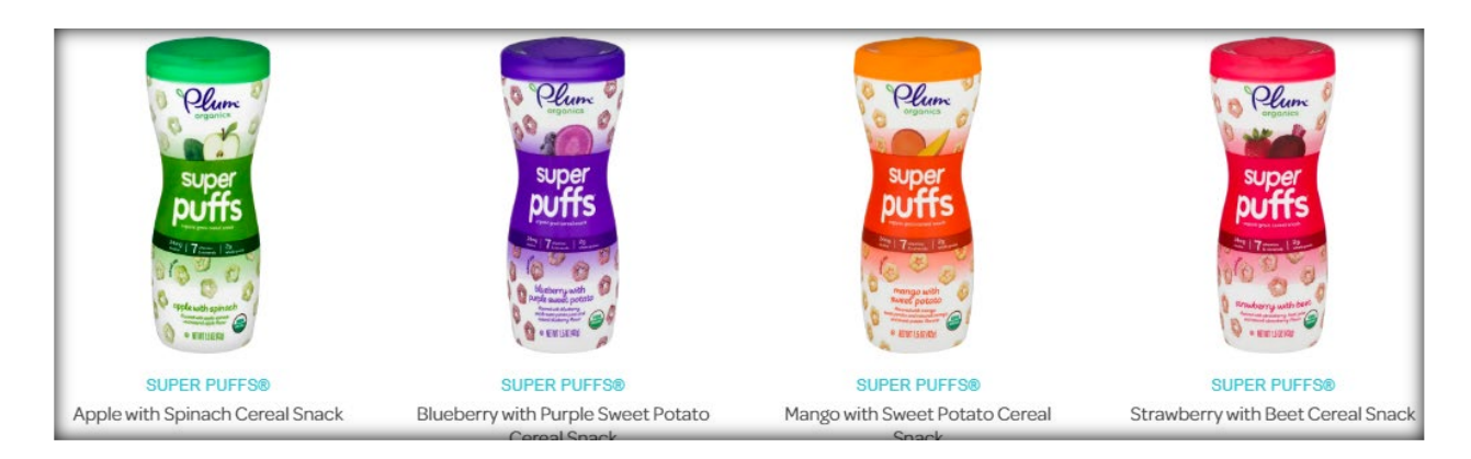
Plum tested its Super Puffs products 19 times between October 28, 2017, and the present.<sup>41</sup>