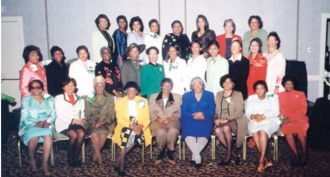
The West Palm Beach Chapter of The Links, Inc.